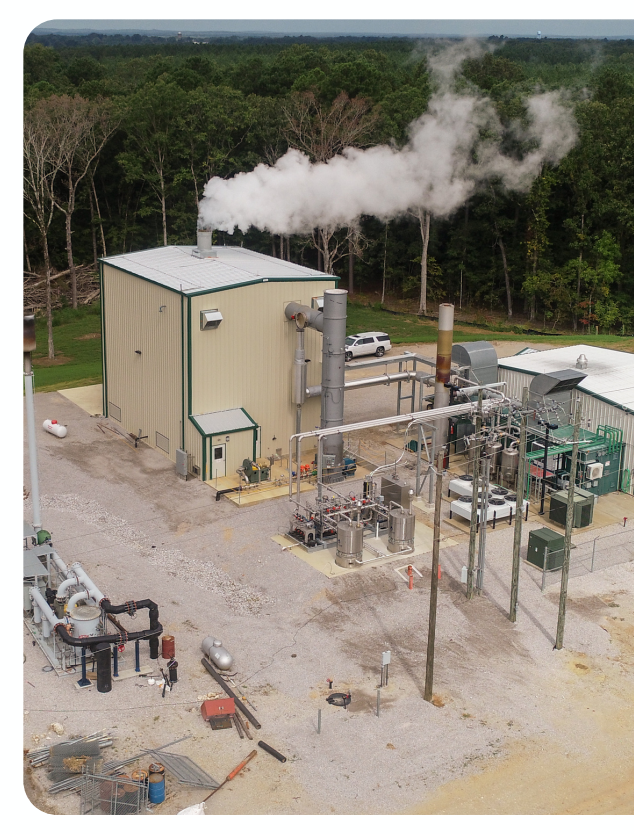
Figure 1. Heartland Concentrator

On-site leachate solution eliminating trucking